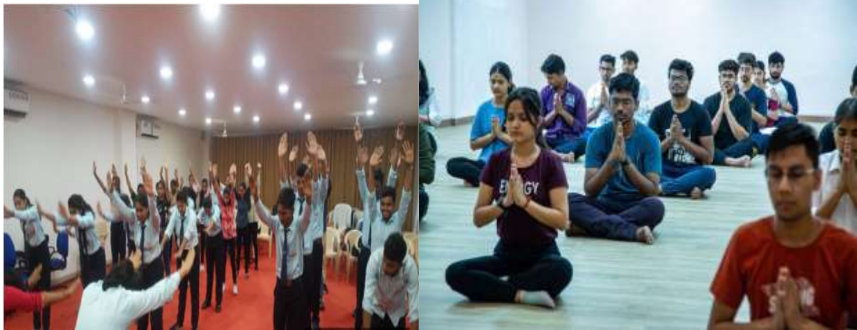
“Student & Faculty during International Yoga Day in JIT Campus”

Objective- The objective of this program was approach to health, combining physical postures (asanas), breathing exercises (pranayama), and meditation. The celebration of Yoga Day seeks to promote both physical fitness and mental well-being.