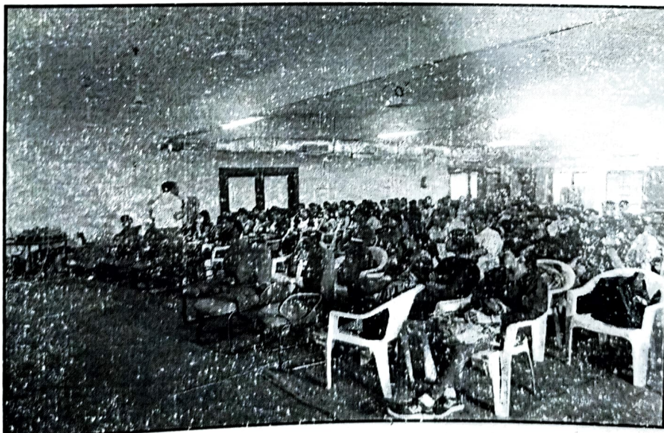
Student Grievance Redressal Awareness Programme on 15 th Oct., 2024

The orientation program was conducted to get familiarization of the aims, objectives, functioning and mechanism of the cell among the students. During the program all the Head of Department were present to encourage students. Students from Engineering, MBA, M.Tech were also present in the programme.